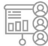
User & Market Adoption