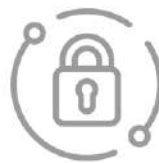
Compliance & Security